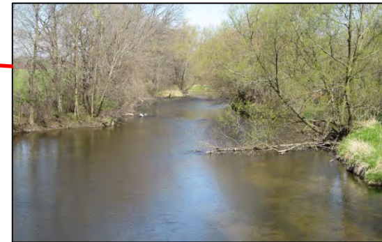
Typical view at level 5.8