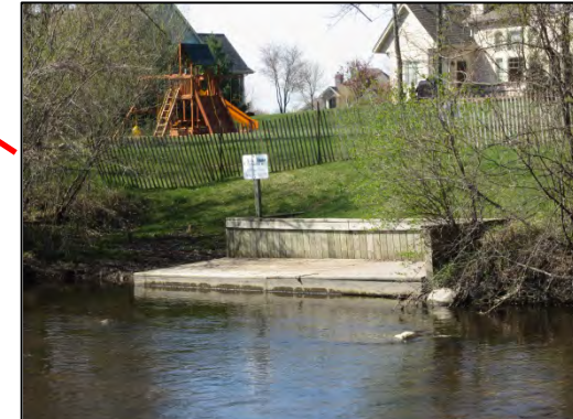
Cedar Creek Farms Canoe Take-out