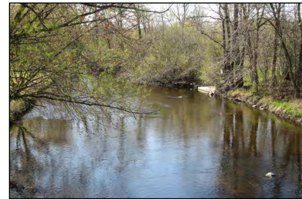
River approach to Cedar Creek Farms Canoe Take-out