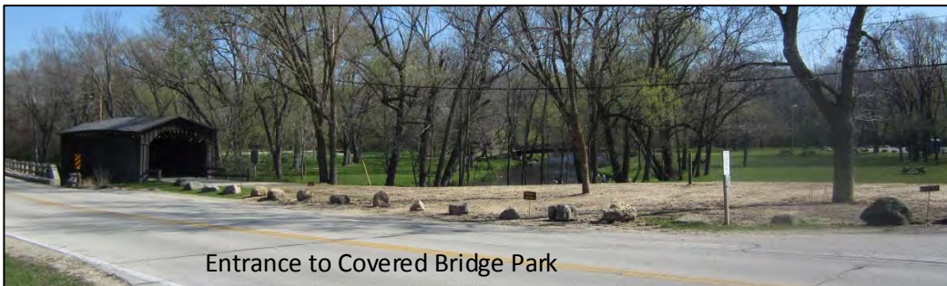
Entrance to Covered Bridge Park