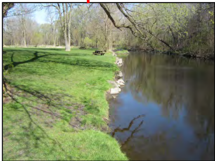
Covered Bridge Park Launch