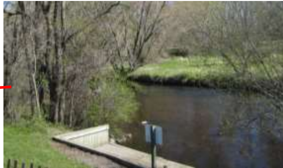
Cedar Creek Farms Launch