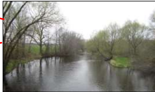
Typical river views at water level 5.8