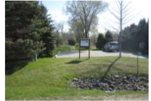
Launch entrance at Robin Ct.